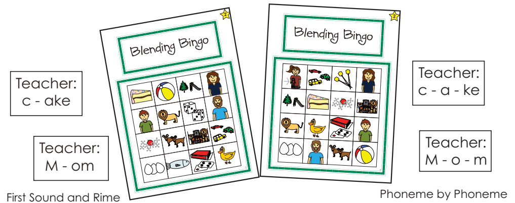
Figure 3. Blending Bingo Game